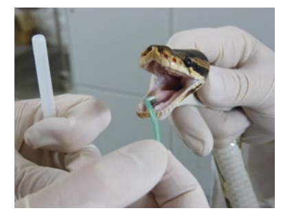
Fig. 5: Tracheal lavage sample taken from a ball python. Tracheal lavage samples can be examined cytologically. They can be used to detect inflammation, changes in the respiratory tract, and possible involvement of bacteria or fungi. Lavage samples can also be used for further diagnosis of infectious agents, e.g. ferlaviruses or nidoviruses.

Pneumonia is relatively common in reptiles living in captivity, in part due to the anatomy of the reptilian respiratory tract (no diaphragm, relatively simple lung structure, air sacs in some species). Pneumonia is frequently caused or promoted by poor husbandry, such as low temperatures, draught, poor hygiene, or insufficient ventilation. Inflammation is often chronic and the cause can be difficult to determine. Affected animals can remain without noticeable clinical signs for extended periods of time, so that reptiles with noticeable pneumonia are often already seriously ill. Lifting the head while breathing (especially in snakes) can be a sign of dyspnoea. In chelonians, increased movements of the limbs in time with the breathing may be visible. Mucus or fluid (including blood) in the oral cavity can be a sign of inflammation of the lungs. However, disorders of other systems and space-occupying processes in the body cavity (e.g. laying activity, especially in chelonians, obesity, constipation, tumours) can also lead to dyspnoea. Traumata should also be clarified as a possible cause. In addition, there are several viruses and parasites that can lead to changes in the lungs (Table 5). Bacteria and fungi may also be involved in pneumonia, although these are usually facultative pathogens. Diagnostically, imaging techniques play an important role. Furthermore, tracheal lavage samples (Fig. 5) can provide