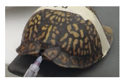
Fig. 1 C: Blood collection from the subcarapacial sinus of a box turtle