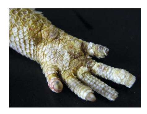
Fig. 7: Fungal infection of the skin of the foot of a bearded dragon. A mycological examination is recommended to detect the fungi and to diagnose the species. Histopathology is recommended to clarify the role of the fungi in the disease and to verify the findings.

Skin lesions that are commonly presented in practice are generally not primarily infectious. These include burns caused by contact with heat lamps or heating pads that are too warm, as well as various traumata such as bite injuries caused by feeder animals or conspecifics. In some species, such as water dragons or very agile snakes, rostral trauma regularly occurs due to repeated contact with the terrarium walls. Moulting disorders can be caused by many different factors such as incorrect ambient temperatures, keeping animals too dry or too moist, and malnutrition. Too much humidity in the terrarium can also lead to so-called blister disease, a primarily sterile dermatitis, in snakes. Bacterial dermatitis can result from keeping animals under poor hygienic conditions. The bacteria involved are usually part of the normal intestinal or environmental flora. This can lead to septicaemic cutaneous ulcerative disease (SCUD) in aquatic turtles. Septicaemia can lead to petechial bleeding under the skin and reddening of the skin. As a primary pathogenic bacterium, Devriesea agamarum causes dermatitis, mainly in spiny-tailed lizards (Uromastyx spp.) but also in other species, especially around the mouth. Various fungi can be secondarily involved in dermatitis (Fig. 7). However, some primarily pathogenic species of the family Onygenaceae (Nannizziopsis and Paranannizziopsis spp. in lizards,