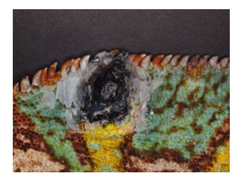
Abb. 8: Cutaneous melanophoroma in a veiled chameleon. Diagnosis can be made by histopathological or cytological examination.